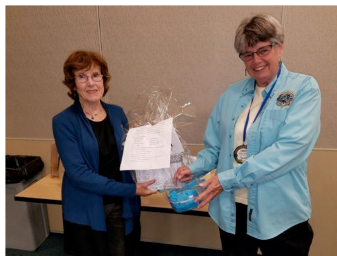
Nov. 17 – Inner Wheel selling basket tickets – benefits Myoelectric Limb Bank – Inner Wheel USA project