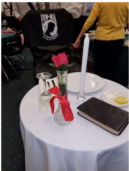
POW – MIA memorial