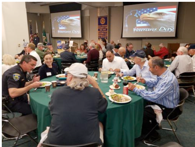
well attended meeting!