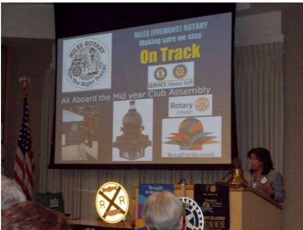
Jan. 21 – Club Assembly