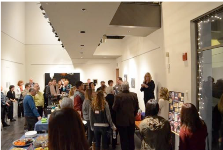
a reception honoring donors, including Niles Rotary