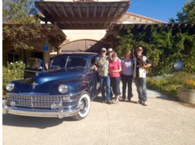
The Cass house and limo day, donated by Cass Winery in Paso Robles