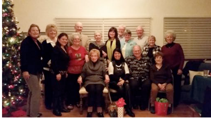
Members and guests of Niles Fremont Inner Wheel at holiday party