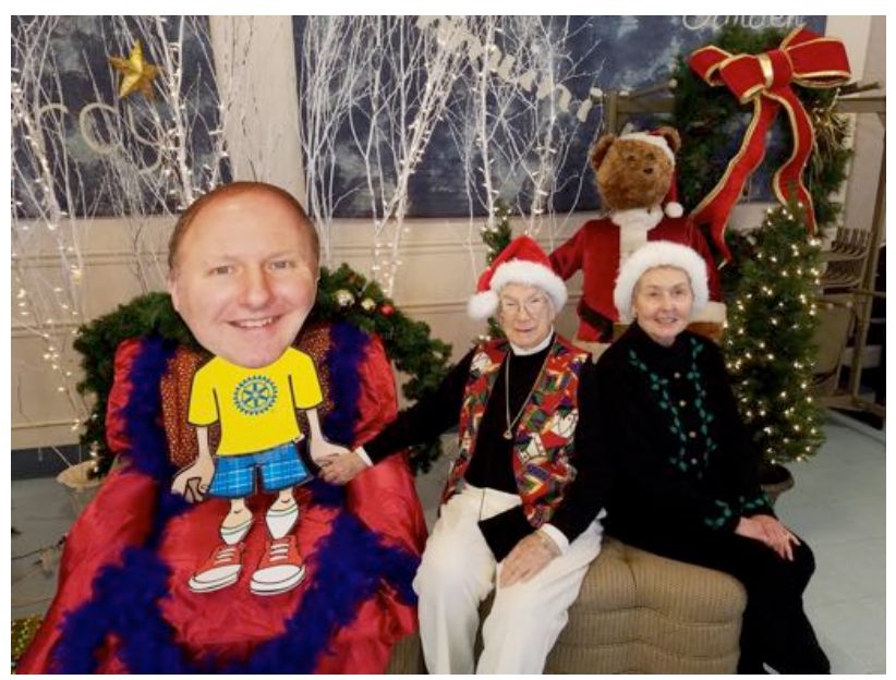
Kimbers with Flat Angus