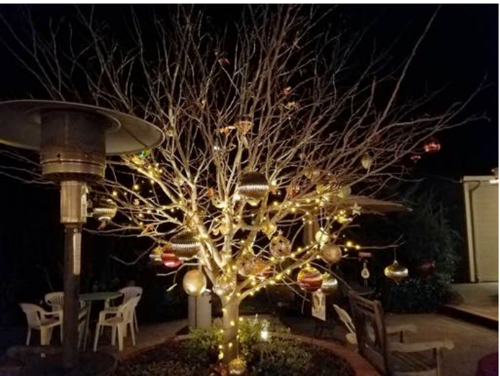
beautiful decorations everywhere