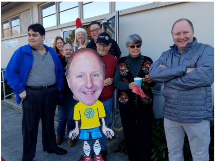
Watching the horse rides