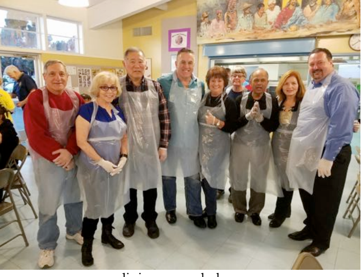
dining room helpers