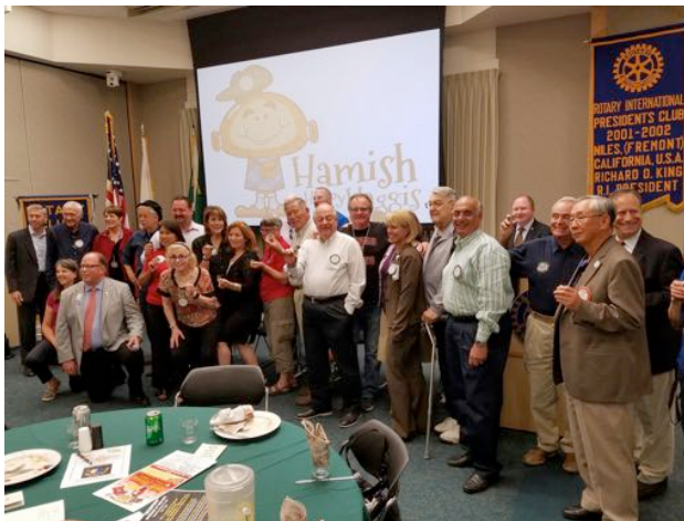
Sept. 29 – PHF double sustainer donors & pledges