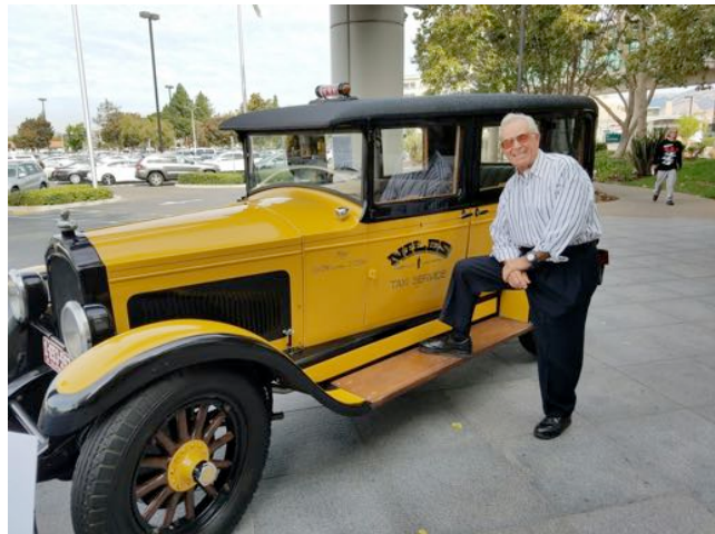
Oct. 13 – promoting the Niles Crawl