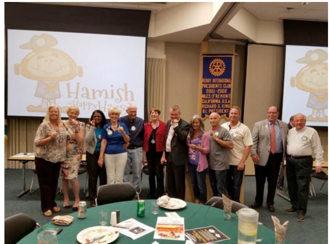
Sept. 29 – Paul Harris Society donors/pledges