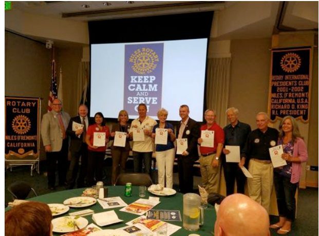
new members of the Order of the Stinking Rose