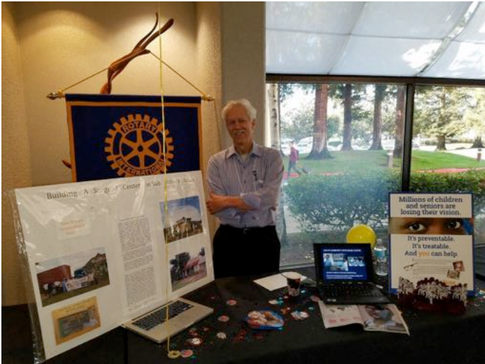
Rich at display for Area 3 Matibabu Foundation project