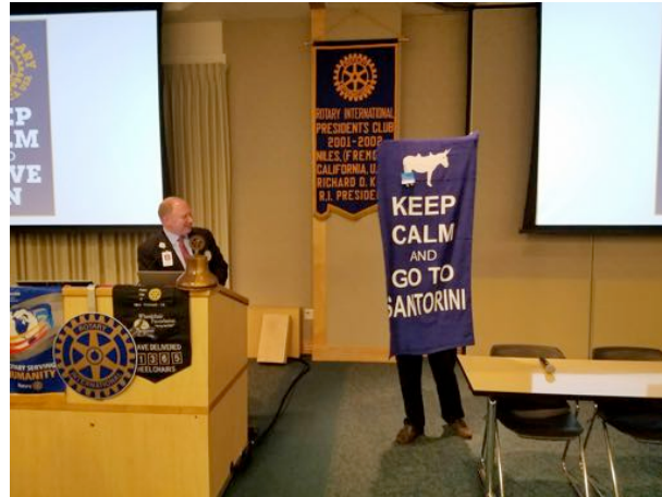
October 20 – Hot Hot Hot Chili Challenge Chili-Ometer Message from Santorini, Greece At $40,000 – $5,000 to go!!

October 27 club meeting photos – will appear in December Pinion