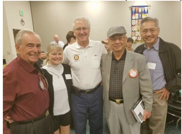
Oct. 6 – Anchorage Rotary exchange guests