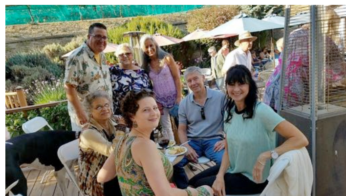
lovely patio setting