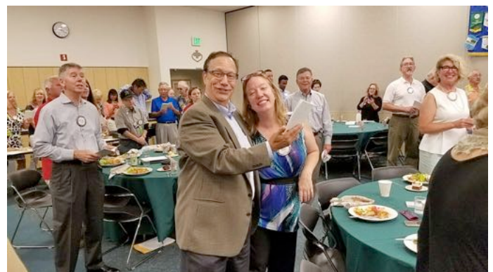
Happy singers – a way of being healthy