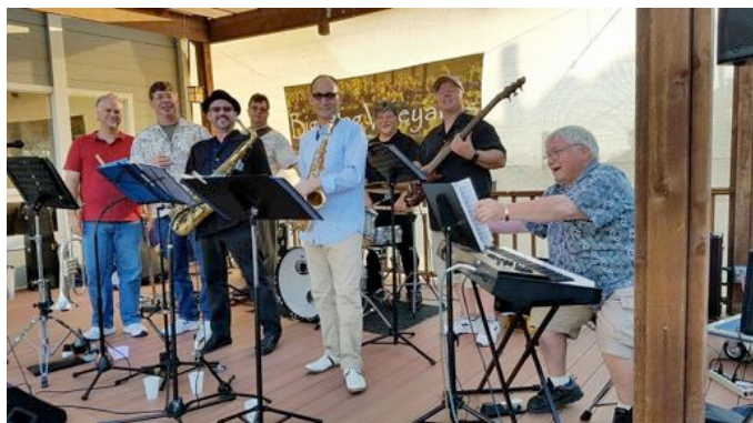
Garage Spider Band