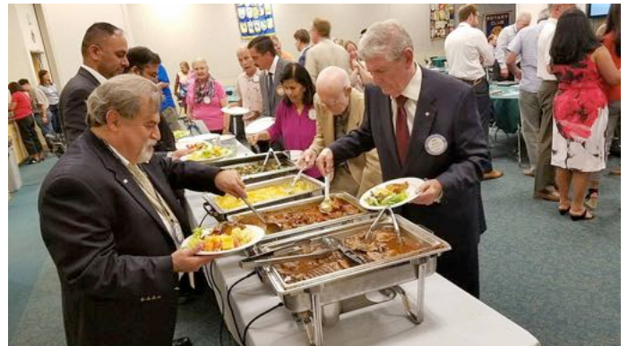
good food at Washington Hospital