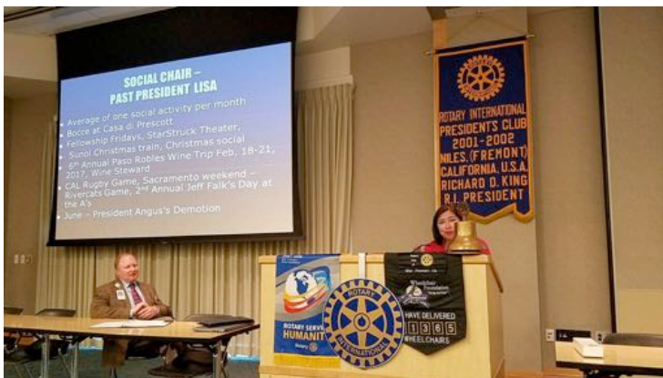
August 11 program – Club Assembly – Plans for the year