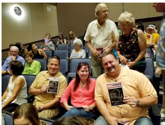
One more StarStruck Theatre photo – see next page