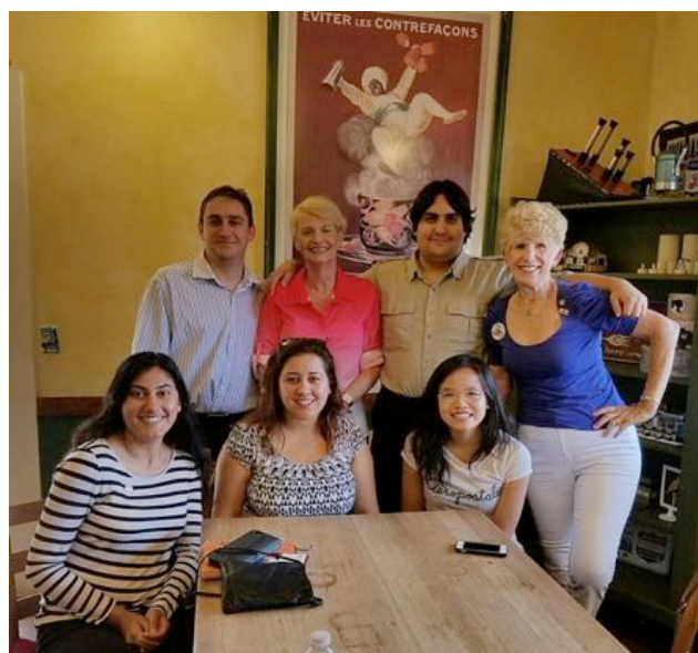
July 31 Rotaract meeting at the Depot Cafe