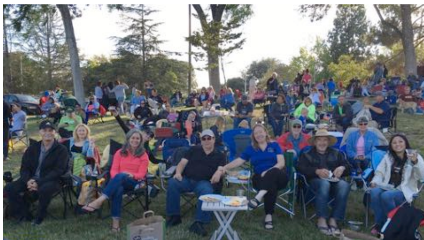
Niles Rotary at Central Park concert July 7

thank you Chuck for hosting the July 4 bbq at your home – enjoyed by 60 people over the afternoon!