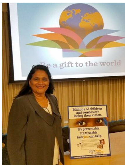
July 14 program – Geeta Kadambi Vision Care for the Needy Worldwide