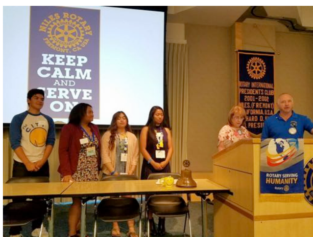
July 14 – RYLA students share their experience at RYLA