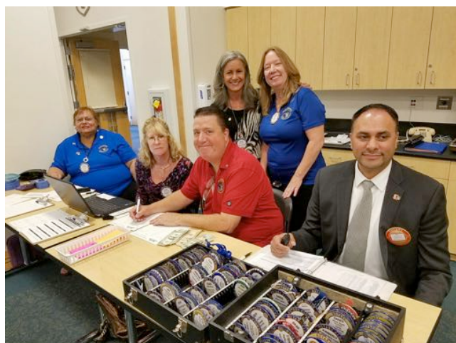
July 7 – back table