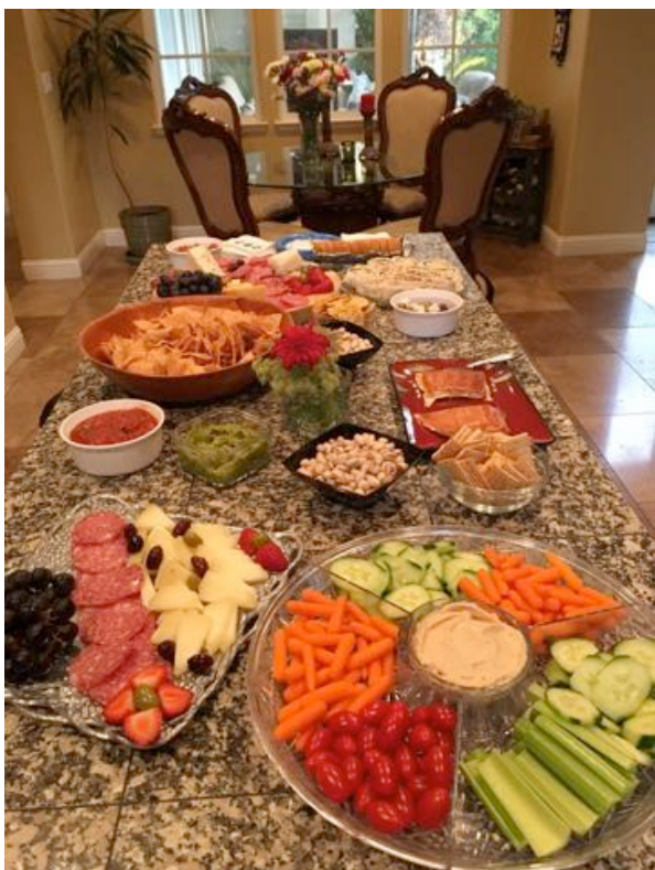
July 29 – lots of good food!