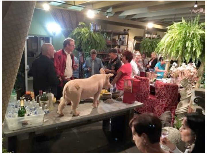
July 15 at Fremont Flowers