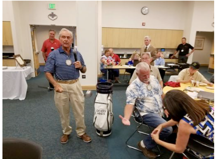
August 26 – Giggle & Golf – Castlewood CC